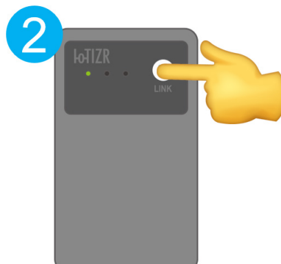
2 Press & hold a button on ECONNECT controller