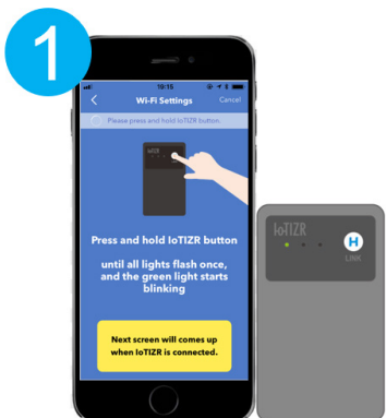
1 Enable bluetooth & login to ECONNECT Toolkit mobile app